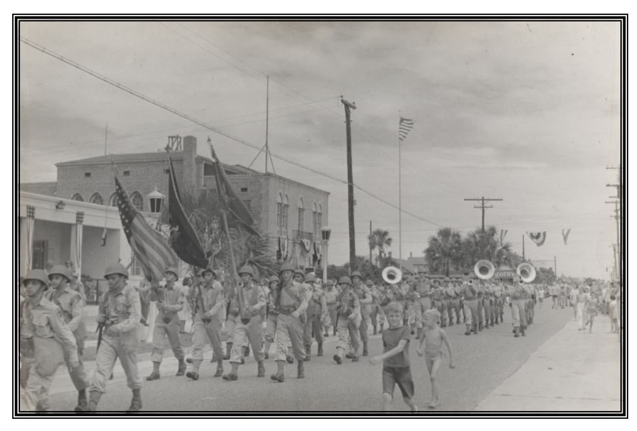
Army troops in a parade at 2nd Street North and Pablo Avenue. The City Hall is the 2 story building on the left. (1946)