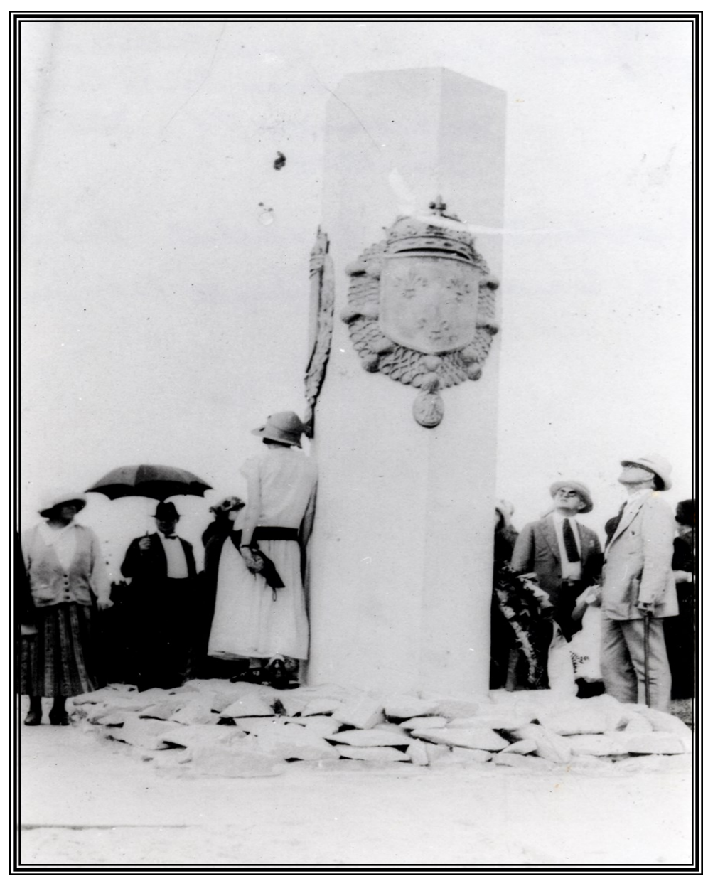
The unveiling of the Ribault Monument at its original location in Mayport before being relocated to the Timucuan Preserve (1923)