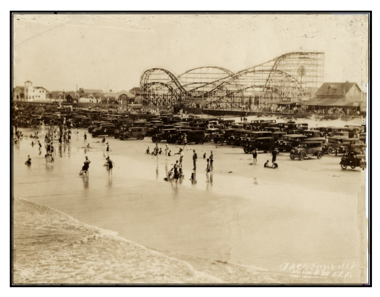
Tourists enjoy the sand and sea at the Boardwalk in Jacksonville Beach. (1929)