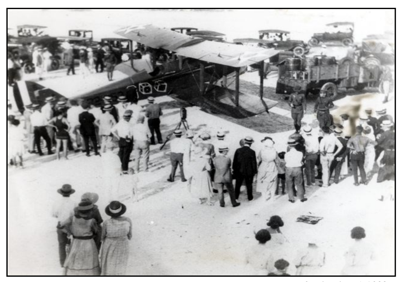
September 4, 1922

This photograph shows a crowd on the beach surrounding the open cockpit of Lt. James H. Doolittle's army issue DeHavilland DH-4 biplane. This photograph was taken prior to Doolittle taking off from Pablo Beach for San Diego, California, Sept. 4, 1922. With only one fuel stop in San Antonip, Texas, Doolittle made the flight from Pablo Beach, Florida to San Diego, California in fewer than 24 hours. Doolittle's feat established a new speed record and helped demonstrate the practicality of transcontinental flight.