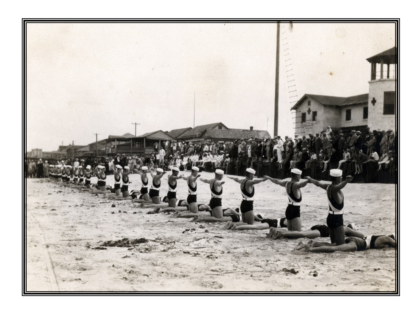
American Red Cross Volunteer Lifesaving Corps demonstrating artificial respiration. (1925)