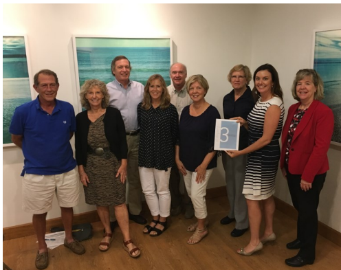
Strategic Plan Page 3