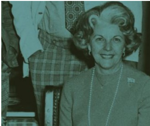
Founders Fund Page 2

THE NEWSLETTER OF THE BEACHES MUSEUM & HISTORY PARK