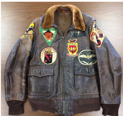
Archives Page 3