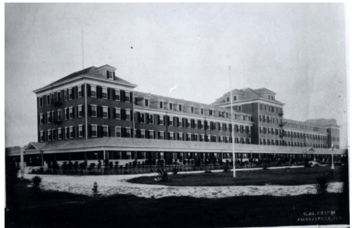
Continental Marker Unveiling Page 6